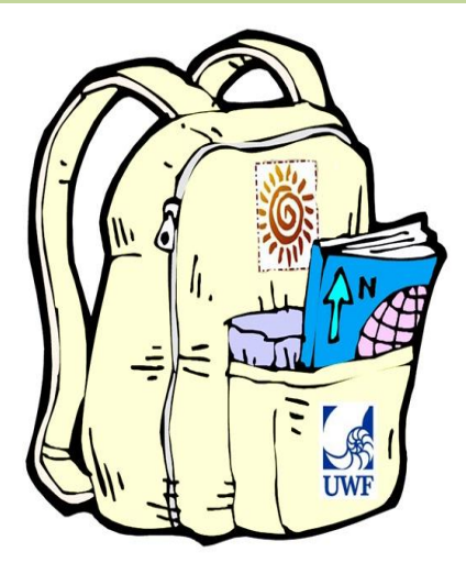
Join us for a backpack full of archaeology-themed lesson plans and hands-on learning!